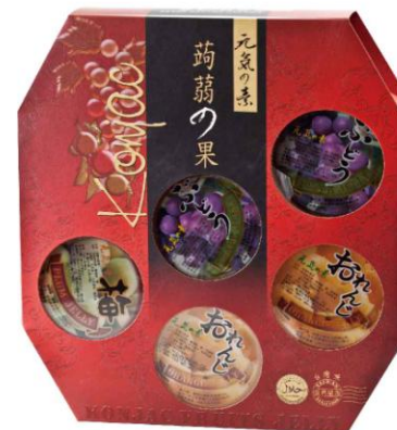
K06 (100g x 6 Cups x 12 Packs / Carton) 蒟蒻の果禮盒 Konjac Jelly Gift Set 口味種類: 柳橙、葡萄、紫蘇梅 3種口味 Flavor: Orange, Grape, Perilla Plum

This is made from seaweed extract and juice. The flavors include perilla plum, grape, and orange that spread out the light and fresh fruit scent lingering in your mouth. The texture is moderately soft and tender, intriguing the prime experience of your taste bud.