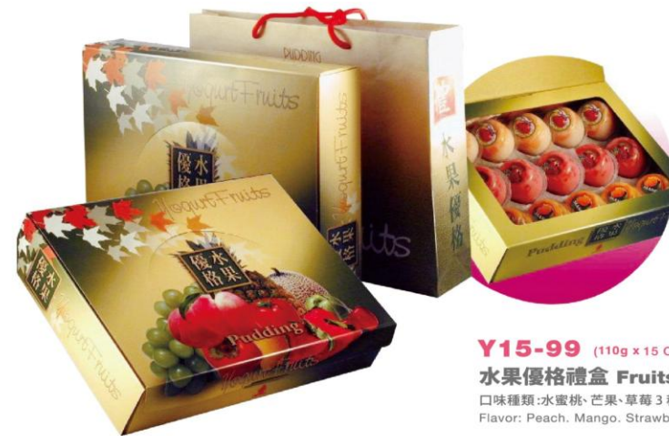
Y15-99 (110g x 15 Cups x 6 Packs / Carton) 水果優格禮盒 Fruits Yogurt Gift Set 口味種類：水蜜桃、芒果、草莓 3 種口味 Flavor: Peach, Mango, Strawberry

使用優質的牛奶發酵原液與果汁調製而成，並加入自創的軟Q有勁的梅花凍丁，口感豐富。此外，本公司運用優質原料及先進技術，做到打開產品封膜時不滴水，其口感柔嫩適中，又兼具安全性，是大人小孩都適合的優質點心。 This texture-abundant product is made from excellent yogurt and juice with self-made springy-texture plum jelly. In addition, we use high-quality materials and advanced technology to achieve the purpose that the yogurt can be unsealed without juice leak. Our yogurt tastes soft and tender with the safe package, which is a great snack for adults and children.