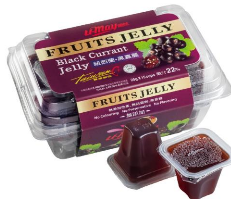
B15-1 (25g x 15 Cups x 12 Packs / Carton) 黑醋栗凍 Black Currant Jelly

The exclusive advanced technology made our product wouldn't leak while unsealing. The taste is soft and smooth; it's tasty and safe for consumers to eat.