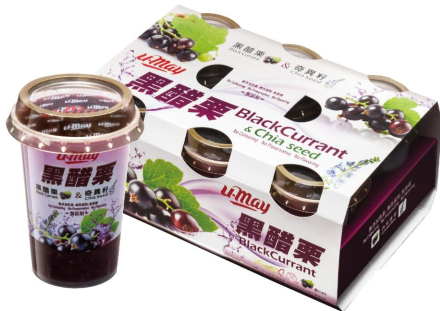
B06-1 黑醋栗 (220g x 6 Cups x 8 Packs / Carton) Black Currant

Without any pigment, preservative and essence, it made by Black Currant juice and Chia Seed which imported from New Zealand and Australia. All the color, smell and taste come from the juice, no additives. People call black currant as "King of fruit" because it contains abundant of anthocyanin which is approved that have ability of antioxidant. Chia seed contains large amounts of minerals and Omega-3. The cortex of Chia seeds is full of dietary fibers which trigger a feeling of satiety. The exclusive technology made Chia Seed coated by Tapioca that enhances the chewiness.