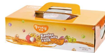
FR2-1 (36g x 50 cups x 6 packs / Carton) 水果蒟蒻禮盒 Konjac Fruits Jelly Gift Set 口味種類: 荔枝、梅子、葡萄 3種口味 Flavor: Litchi, Plum, Grape

主要以海藻抽出物及果汁調製而成,口味包含了荔枝、梅子、葡萄三種,清爽、淡淡的水果香,讓人口齒留香,回味無窮。外型可愛、大方的禮盒,攜帶便利,為年節送禮最適合的選擇。 This is made from seaweed extract and juice. The flavors include litchi, plum, and grape that spread out the light and fresh fruit scent lingering in your mouth. The gift box is cute and generous, which is the best choice for holiday gifts.