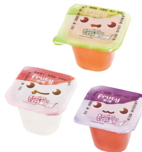
FR2-2 (36g x 10 cups x 20 packs / Carton) 水果蒟蒻 Konjac Fruits Jelly 口味種類: 荔枝、梅子、葡萄 3種口味 Flavor: Litchi, Plum, Grape