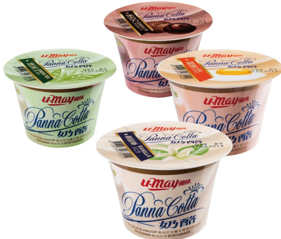
PC24 優妹奶酪 (150g x 24cups/carton) U·MAY Panna Cotta 口味種類：香草、巧克力、抹茶、雞蛋 Flavor: Vanilla, Chocolate, Green tea, Egg

食材使用高品質奶粉製成，味道香濃滑嫩，甜而不膩，細緻面密，富有充分的飽足感，讓人齒口留香。產品不含任何香精、色素及防腐劑，讓大家吃得安心，是適合夏季消暑的優質甜點。 Use high-quality non-fat milk powder; taste mellow, aromatic and soft. It would not only make you satisfied but also taste as good as you remember. The product didn't contain any essence, coloring and preservative; it is a great dessert which is suitable for enjoying in summer.