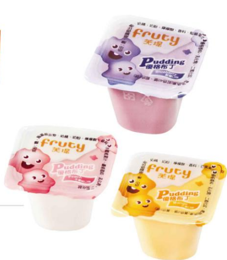
FR1-2 (36g x 10 cups x 20 packs / Carton) 優格布丁 Yogurt Pudding 口味種類: 芒果、藍莓、水蜜桃 3種口味 Flavor: Mango, Blueberry, Peach