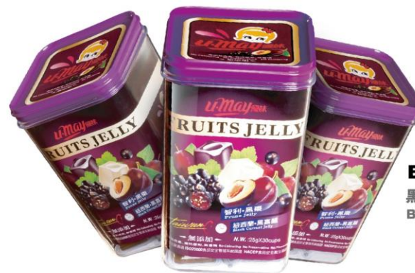
B30-99 (25g x 30 Cups x 8 Packs / Carton) 黑嘉麗凍&黑棗凍 Black Currant Jelly& Prune Jelly