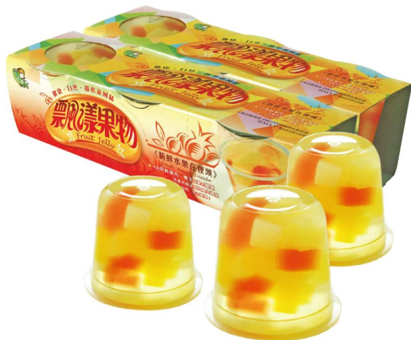
P03 (180g x 3 Cups x 24 Packs / Carton) 小可愛飄漾果物 Pineapple Jelly

This product contains more water that can melt in your mouth instantly and present a sense of coolness. You can eat the actual pineapple fruit, special-made agar Q jelly, and coconut jelly with the unique, flesh and distinct-layer taste.