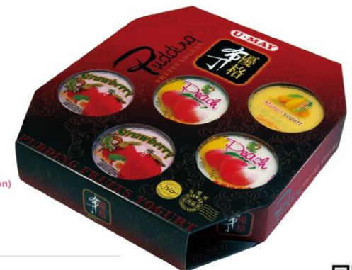
Y06-3 (110g x 6 Cups x 12 Packs / Carton) 水果優格 Fruits Yogurt 口味種類：水蜜桃、芒果、草莓 3 種口味 Flavor: Peach, Mango, Strawberry