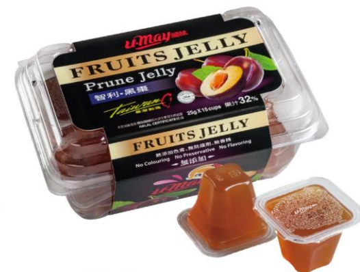
B15-2 (25g x 15 Cups x 12 Packs / Carton) 黑棗凍 Prune Jelly