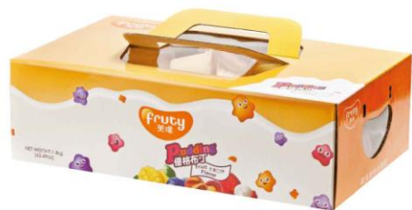
FR1-1 (36g x 50 cups x 6 packs / Carton) 優格布丁禮盒 Yogurt Pudding Gift Set 口味種類: 芒果、藍莓、水蜜桃 3種口味 Flavor: Mango, Blueberry, Peach

使用優質的牛奶發酵原液與果汁調製而成,且無添加防腐劑,口感軟Q、清甜,冷藏後,食用更加冰涼爽口。外型可愛、大方的禮盒,攜帶便利,為年節送禮最適合的選擇。 This is made from excellent yogurt and juice and it tastes soft and springy. No additive. You can enjoy the cool and refreshing flavor. The gift box is cute and generous, which is the best choice for holiday gifts.